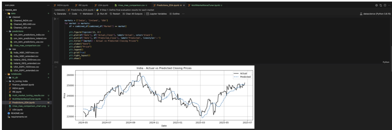
Figure 2: Jupyter Notebook interface open in web browser