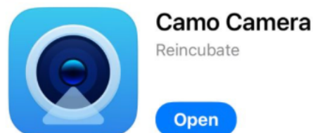
Figure 3: Camo Camera app in App Store.

2.1 Install Camo Camera in the iPhone and Mac.