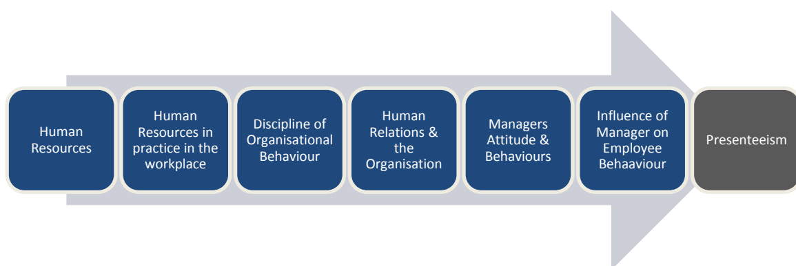
Figure 1: Conceptual Framework – authors thought process