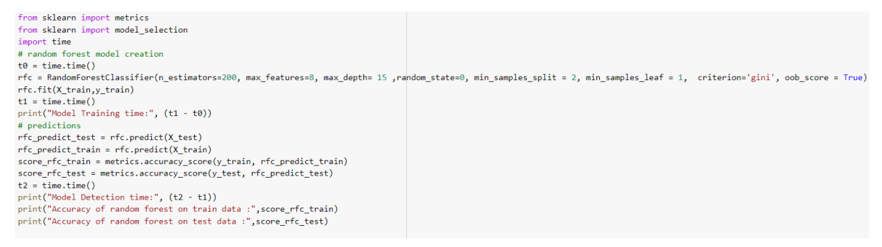
Figure 10: Random Forest Predictive model

The code used for training the machine learning model using the random forest algorithm is shown in the below figure. The below code creates the random forest model which predicts the IoT botnet from the test dataset. The test accuracy of the model along with train accuracy is calculated using the code and also the time required to train the model and test the model is also calculated using the below code. The below code also shows the use of hyperparameters for predictive analysis.