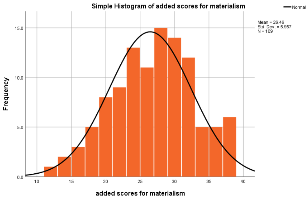
Figure 1. Distribution of Total Materialism scores.

Descriptive statistics for continuous variables such as total socioeconomic status (total SES) scores and total materialism (Total_MAT) scores are presented in Table 1. Total SES scores were entered into the analyses in order to categorise the scores into high and low groups using the mean. Preliminary evaluation of the data revealed that both SES and MAT scores were normally distributed with no major outliers present. The slightly elevated SD scores imply that these scores are susceptible to variability. Figure 1 highlights the relatively normal distribution of added materialism scores. Furthermore, frequencies for categorical variables such as Gender, SES and Family Structure are displayed in Table 2.