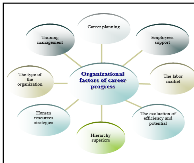
Fig 2.4: Objective Factors. Palade (2010) p. 127