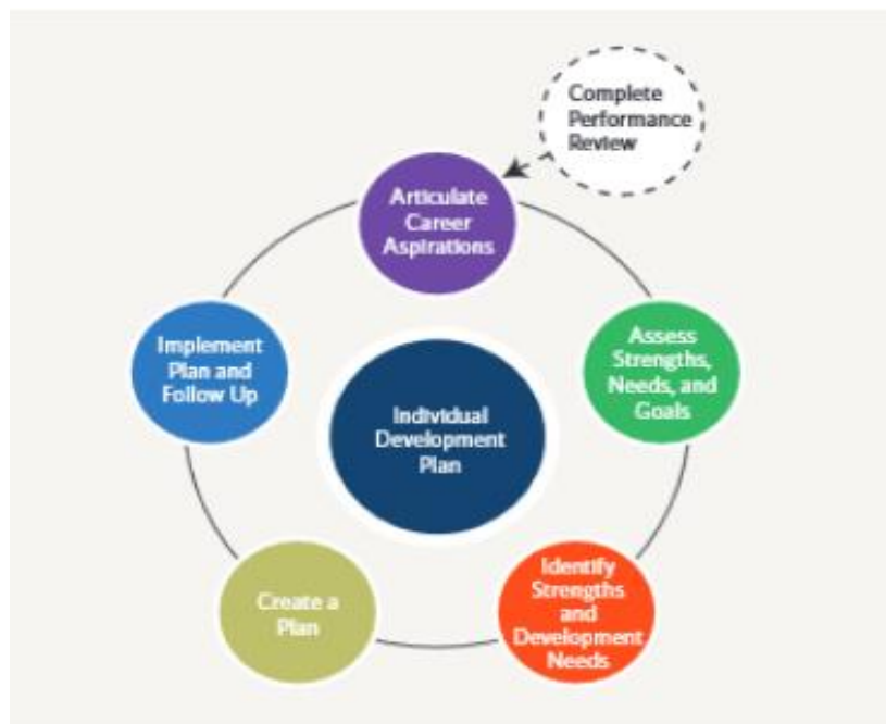
Fig: 2.6 - Employee Development Process Map. Hosmer (2015) p.6

It is now important to reiterate the fact that business objectives must align with the needs of the employee, otherwise there will not be a good return on the time and money invested in the learning and development programs. Second, it is also important to have conversations with employees regarding their career aspirations. For these the below points need to be accepted and performed by the organizations (Ross,2014).