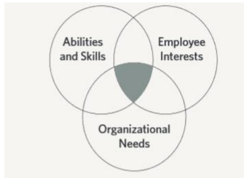
Fig 2.1: Aligning skills and interests with organizational needs. Hosmer (2015) p. 3