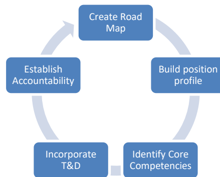
Fig: 2.5 – Career Pathing Process. Cao and Thomas (2013)

Career paths and ladders can also be used as tools to retain employees and achieve organizational goals (SHRM,2015). While Cao and Thomas (2013) argue that career paths will be more effective if used in conjunction with the company's overall development systems. They have also developed a career pathing process which includes creating a career map which shows different possible positions and roles in one's career.