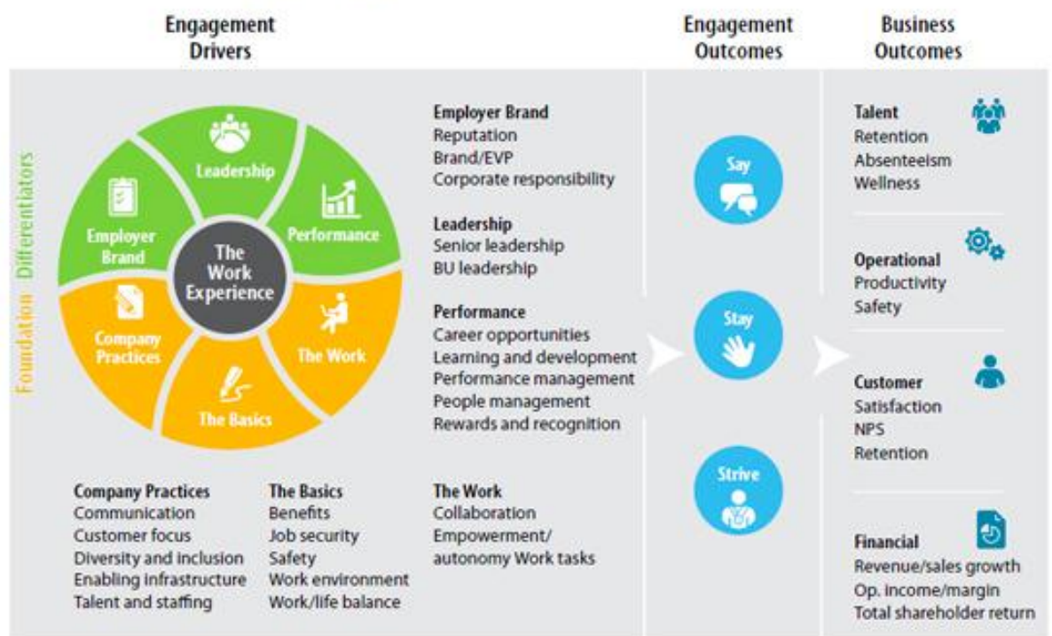
Fig.1. Aon Hewitt Model (2014)

Cook (2008) further supports this engagement model by stating that if employees are engaged in work, they will be more productive, present and passionate, thus