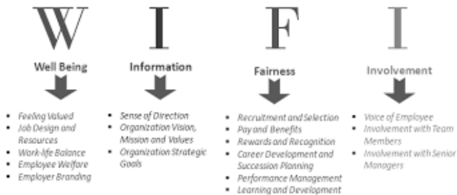
Fig.3. Cooks WIFI Model (2008)

is only truly effective when it is relayed from top to bottom. Employee's are more likely to be engaged when management are giving clear communication and direction (Cook, 2008).