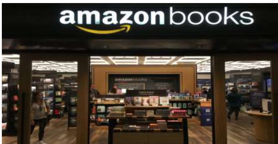
Figure 1- Amazon Books Physical Store ( www.landor.com , 2018)

The modern entrepreneur may be more likely to start their business online rather than the traditional sense of procuring a brick-and-mortar store and expanding from there. This change has occurred with the aid of social media's impact on the business environment. This online business may proceed to grow their audience, before finally investing in a brick-and-mortar premises for the good/service once an established connection with their audience is found. This is a shift in the way entrepreneurs work as online growth spurs the need for expansion into the physical world. Jeff Bezos' Amazon has achieved this by bringing 'Amazon Books' to the offline world after Amazon's proven online success ( www.amazon.com , 2021). This indicates that although social media and the online world is a very attractive market to enter, there is still a place for businesses in the physical world.