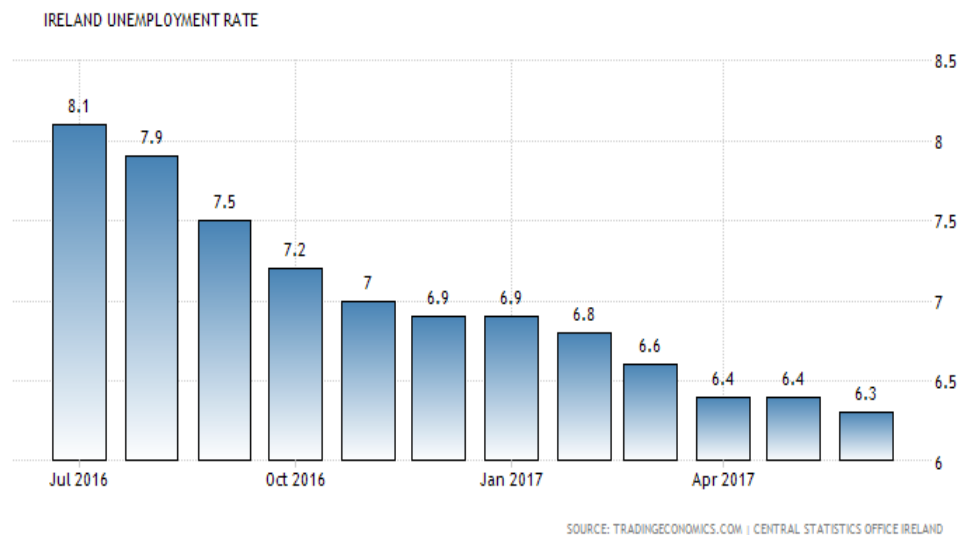
Figure 2. (Trading Economics, Website, 2017)

The rapid reduction in the amount of people unemployed in Ireland (Figure 2) clearly prove that the government decision to introduce the Activation service is a success and it is important that the service is continually improved upon.