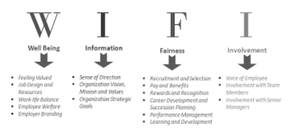
Fig.3. Cooks WIFI Model (2008)

is only truly effective when it is relayed from top to bottom. Employee's are more likely to be engaged when management are giving clear communication and direction (Cook, 2008).